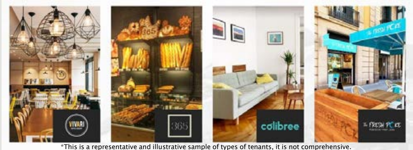
*This is a representative and illustrative sample of types of tenants, it is not comprehensive.